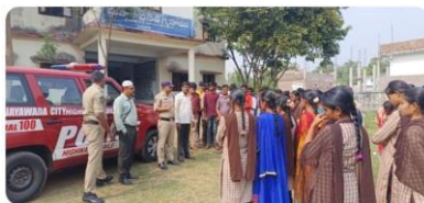
Awareness programme on Anti - Ragging, Conducted by Tiruvuru Police Department