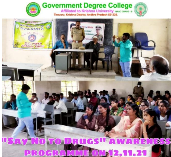
"SAY NO TO DRUGS" AWARENESS PROGRAMME ON 12.11.21

Under the NDPS Act, it is illegal for a person to produce/manufacture/cultivate, possess, sell, purchase, transport, store, and/or consume any narcotic drug or psychotropic substance. Under one of the provisions of the act, the Narcotics Control Bureau was set up with effect from March 1986.