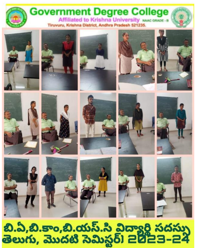
Language and Communication Skills Through student seminars