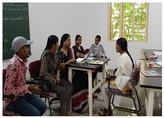
Mock interview by department of English on 7.12.23 (Soft Skills) Language and Communication Skills