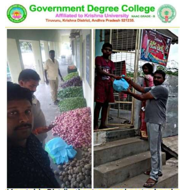
Vegetable Distribution to poor door to door by office staff & Sponsored by all the staff in Corona pandemic