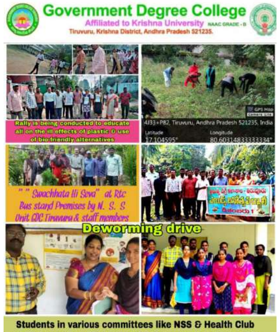
actively participate in Aids & No plastic Rallies & Swachtha hi sewa drives & community health drives