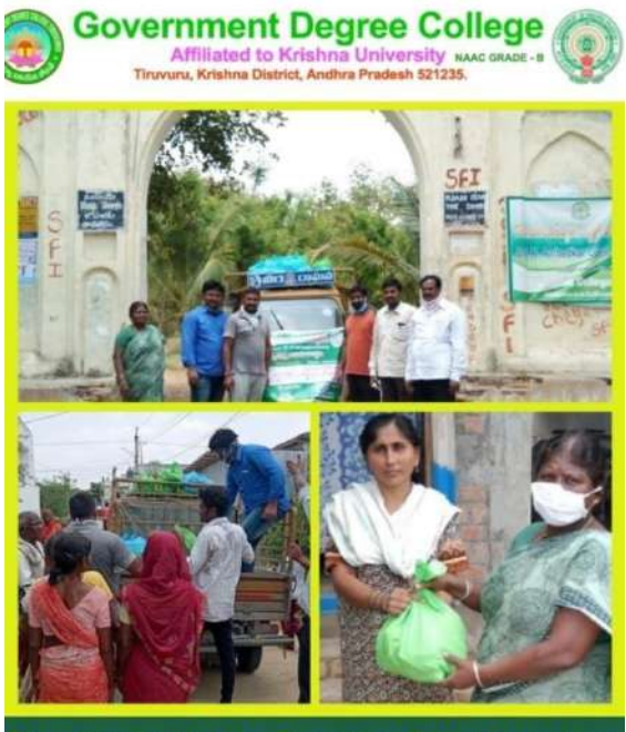
Rice distribution by Teaching & Non teaching staff to poor & needy in corona pandemic