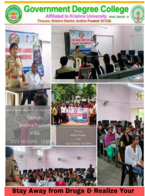
Dream by NSS & Health Club in collaboration with local police officials